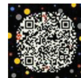
Settlement Services WeChat