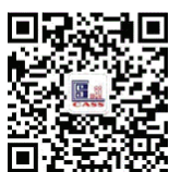
華人服務社微信號